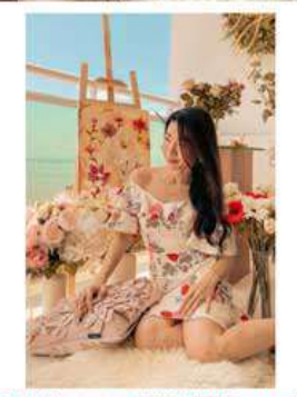
Dahlia Massager and DIROLIER Dress worth RM948 DIANTHUS BUNDLE AVAILABLE IN XS, S, M, L AND XL RM 699.00

DW GIFTCARD RM100 and Automatic Foaming Cleansing Massager (worth RM309) GLOW BUNDLE AVAILABLE IN BUNDLE RM 209.00